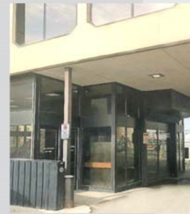
Open 5:30a.m.- 8:30p.m.