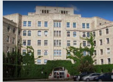
Open 5:30a.m.- 9:00p.m. After Hours Intercom Access