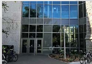
Open 6:00a.m.- 11:00p.m.