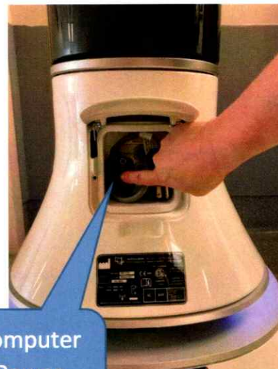
Computer Power Button